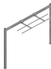
Two Rain Arch Mount