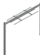
Three Rain Arch Mount