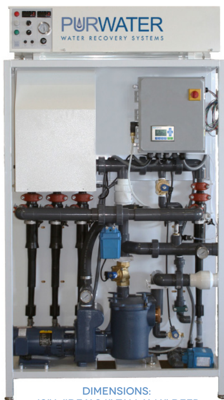
DIMENSIONS: 48" WIDE X 84" TALL X 16" DEEP