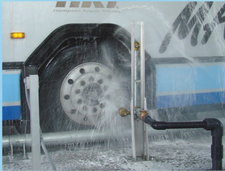
Wheel washers use opposing nozzles to regulate user-set RPM – unlike hydraulic washers, they're maintenance-free and offer greater cleaning angles, consistent performance, and a much lower cost