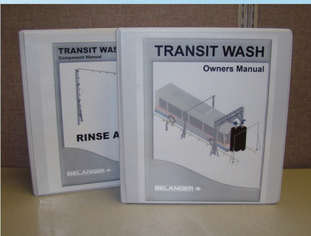
The industry's best, most comprehensive O&M manuals help ensure you get the most from your wash system investment