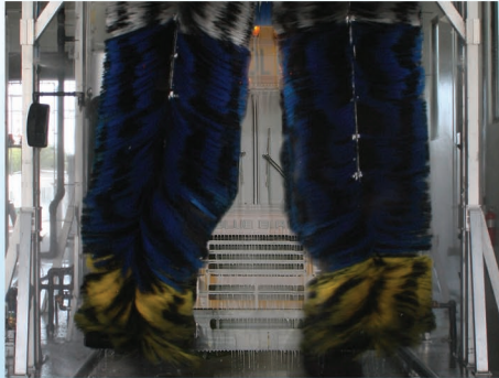
SmartTouch™ XL brush arm activators provide just the right pressure, pneumatic speed & hydraulic smoothness – minimizing potential damage