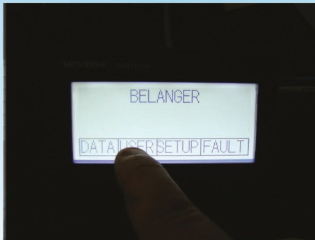
Conserva™ controller can shut off water and power in less than one second between buses – and features intuitive touch-screen interface with simple, powerful wash package programming