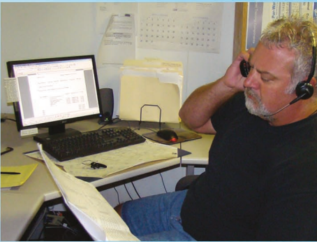
Knowledgeable factory technicians provide phone-based technical support, with extended "on-call" availability