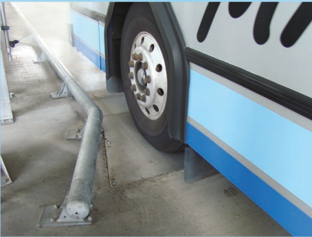
Galvanized guide rails use a 'rolling' design, preventing buses from climbing out, to keep the wash running smoothly