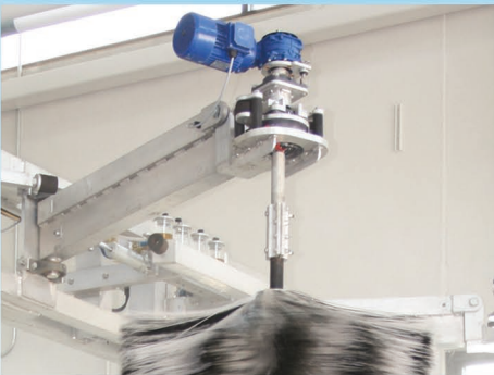
Patented socket joint on Gyro™ Wraps and single-hung brushes supports full brush weight, protecting motor & gearbox