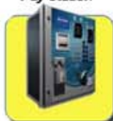
Goldline Plus Pay Station

It is one thing to promise technology; it is another thing altogether to deliver on the promise. The design and construction of the Rainmaker Automatic Car Wash delivers! Rotating wands results in a superior wash product by completely covering the vehicle's surface with a dynamic scrubbing action. Continuous sizing delivers a safe and quality wash process for every vehicle. Rugged design and quality components deliver an equipment package that will provide quality performance year after year with a minimum of maintenance and repair.