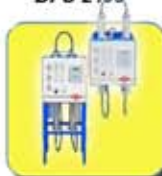
R/O System DFS-2400