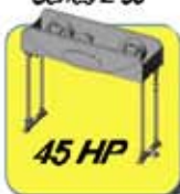
Executive Series E 30