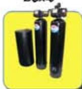
Spotfree System DCX-6