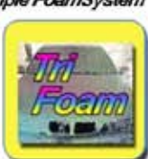
Triple Foam System