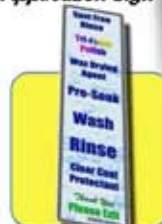
8 Section Application Sign